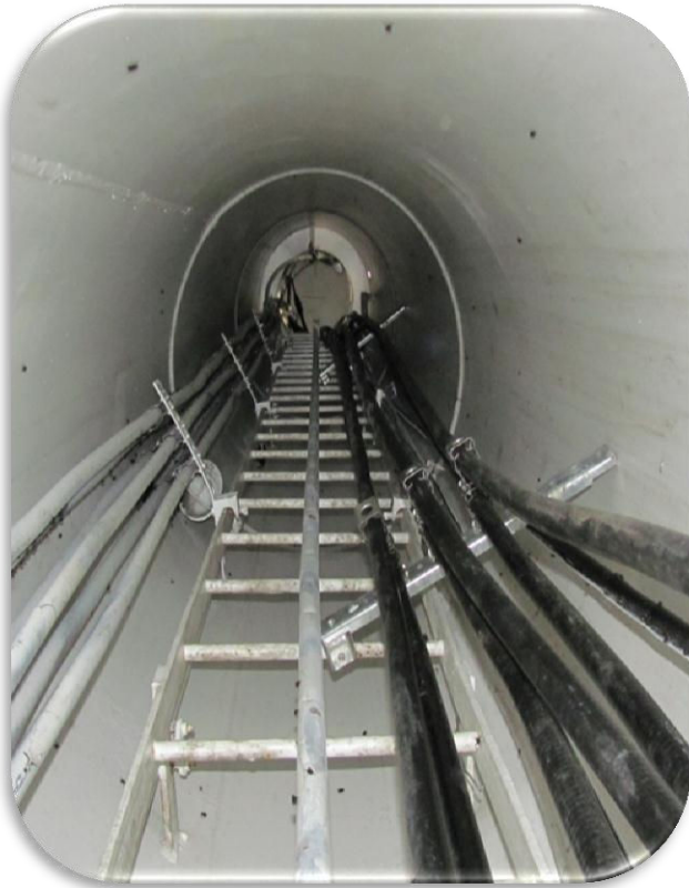
Photo 1 (a cellular company has installed cables on the side and face of ladder)