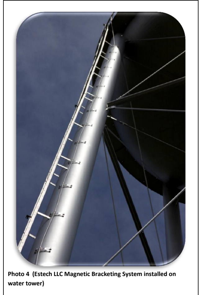
Photo 4 (Estech LLC Magnetic Bracketing System installed on water tower)